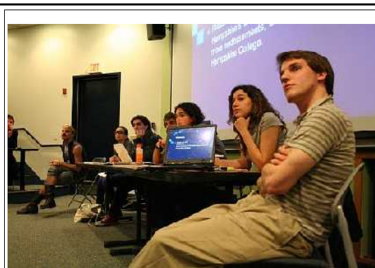
Hampshire College Students for Justice in Palestine present their research at an informational meeting on divestment.

Divestment, which itself is one form of boycott against Israel and its apartheid regime, had been introduced in North America as stepping stone towards a broad, comprehensive boycott of Israel. As the Palestinian cause was severely mischaracterized in the US, and in the post 9-11 world of anti Arab and Muslim sentiment, a limited demand of boycott was the necessary approach to create a debate around the merits of boycott and Israel's apartheid policies, and lay the foundation for the future comprehensive BDS call.