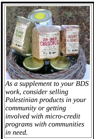
As a supplement to your BDS work, consider selling Palestinian products in your community or getting involved with micro-credit programs with communities in need.